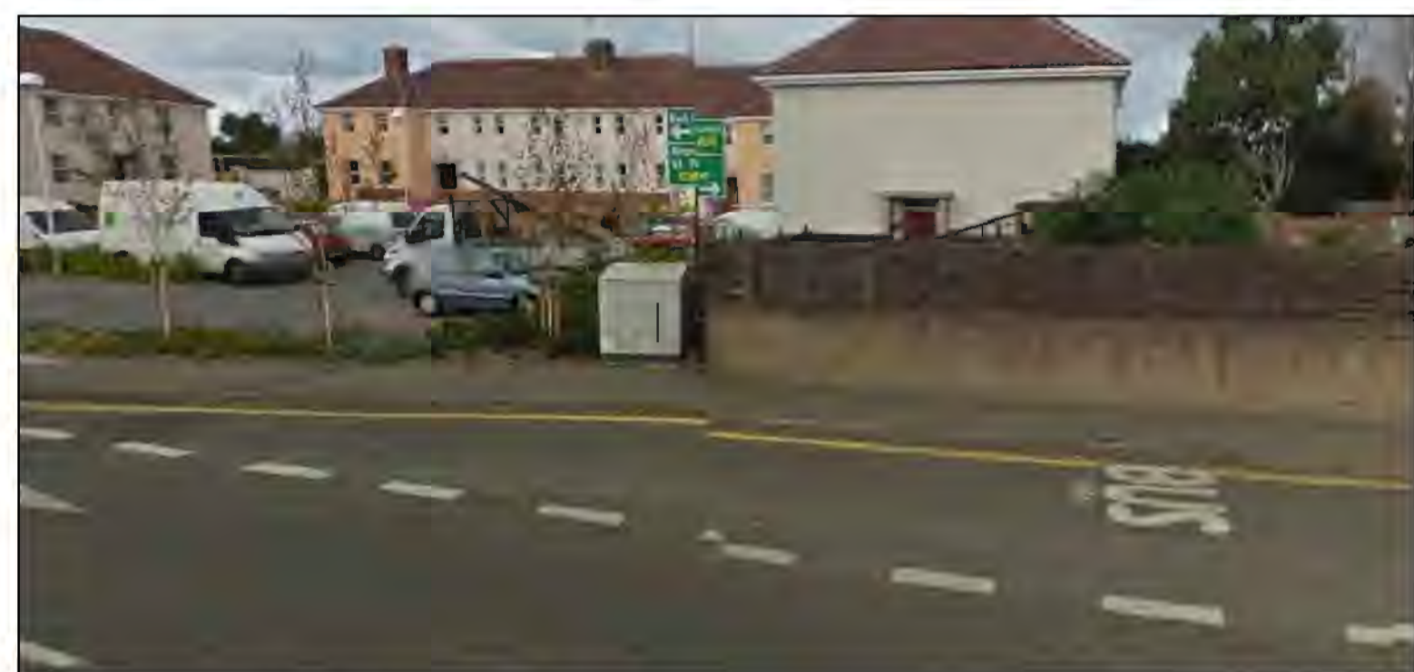
Photo A - Showing Location of Proposed Shelter

3 Bay Fully Enclosed Bus Shelter Specification: Description: Pyramid Roof/3 Bay Fully Enclosed / Two Front Openings Dimensions: 1300mm Wide x 3000mm Long x 2500mm High Seating: Perch Seating Length of Shelter/ 700mm from Ground Level Glazing: Roof - Bronze Tinted Polycarbonate Colour: Dark Green framing