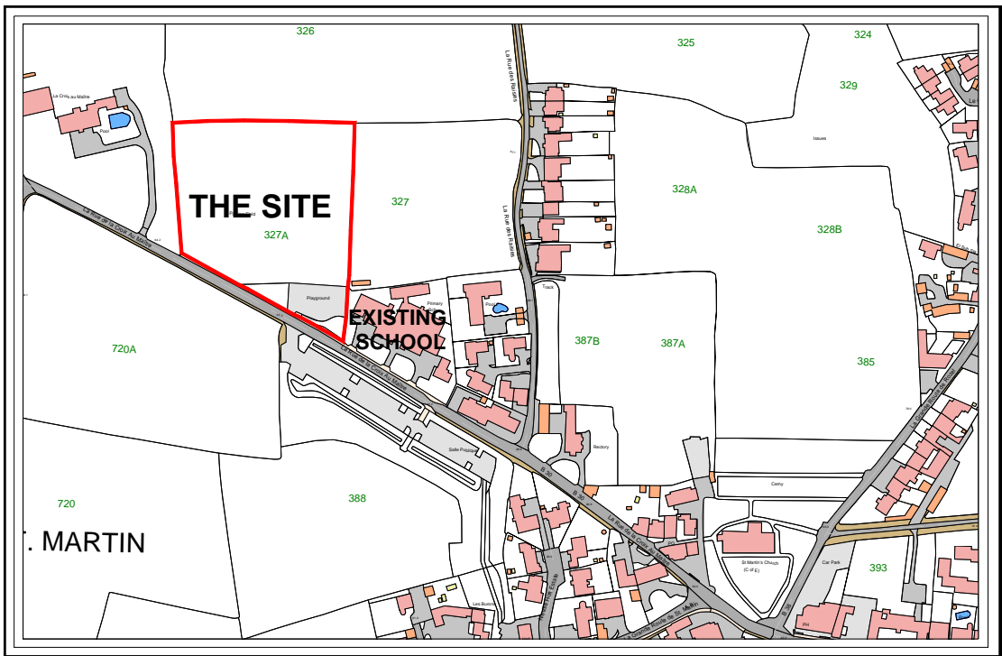
Figure 1. Location plan.

The site is located on relatively high ground on the edge of a rural settlement and any new structure is likely to be visible in the wider landscape from the north, south and east. The setting is a transitional area; on the east side is the formal municipal built-up area of the existing Victorian school and Parish administration buildings and on the other the site leads on to the open rural countryside.