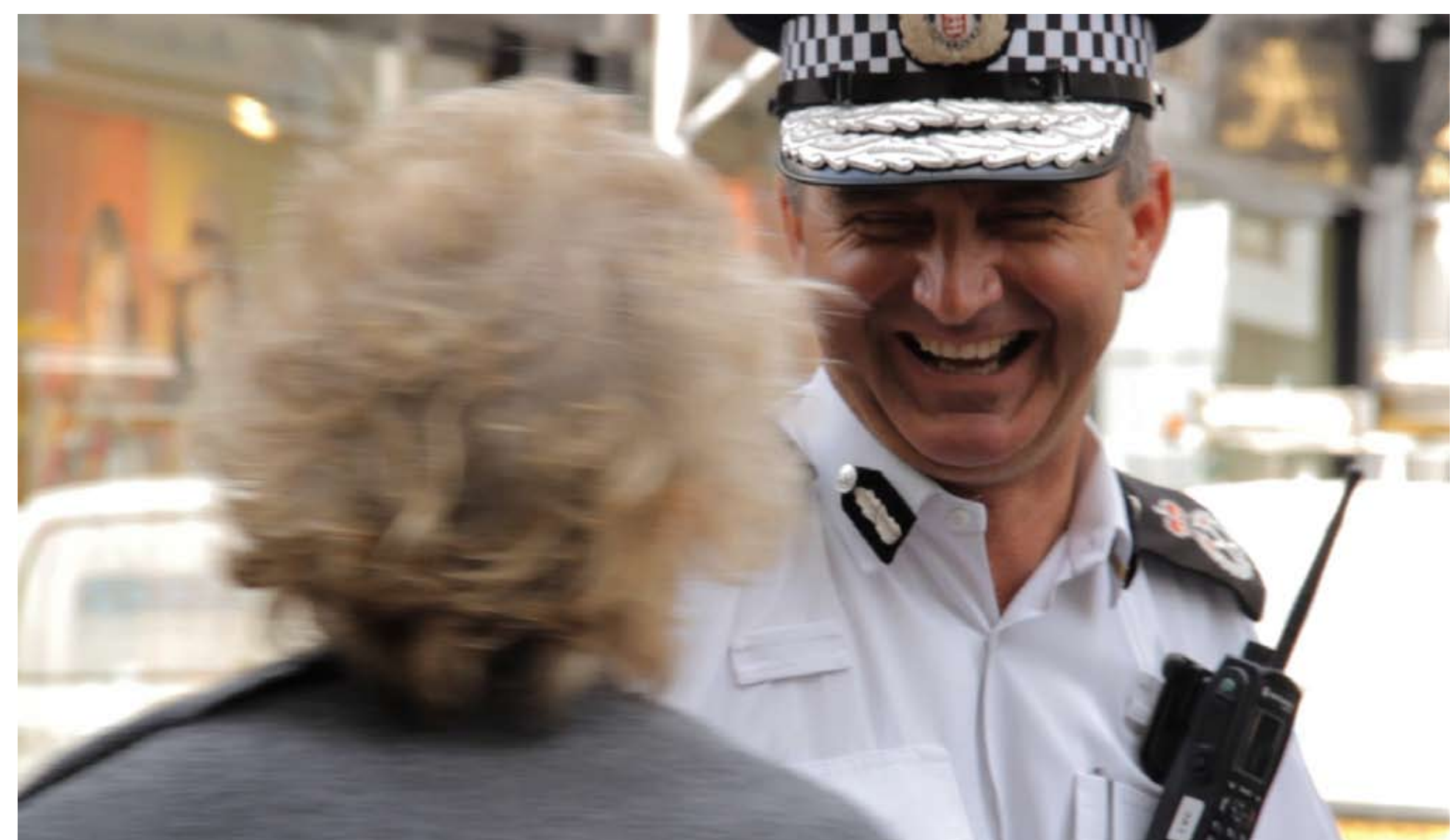
The States of Jersey Police are determined to be good neighbours.

Their high visibility presence will provide extra security and reassurance to people living and working nearby, and staff will respond quickly to any issues that might concern neighbouring residents.