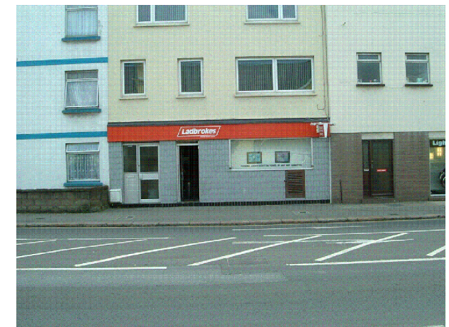
Photo B - Looking South at Proposed Site