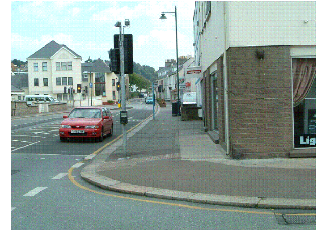
Photo A - Looking East along La Route de St Aubin