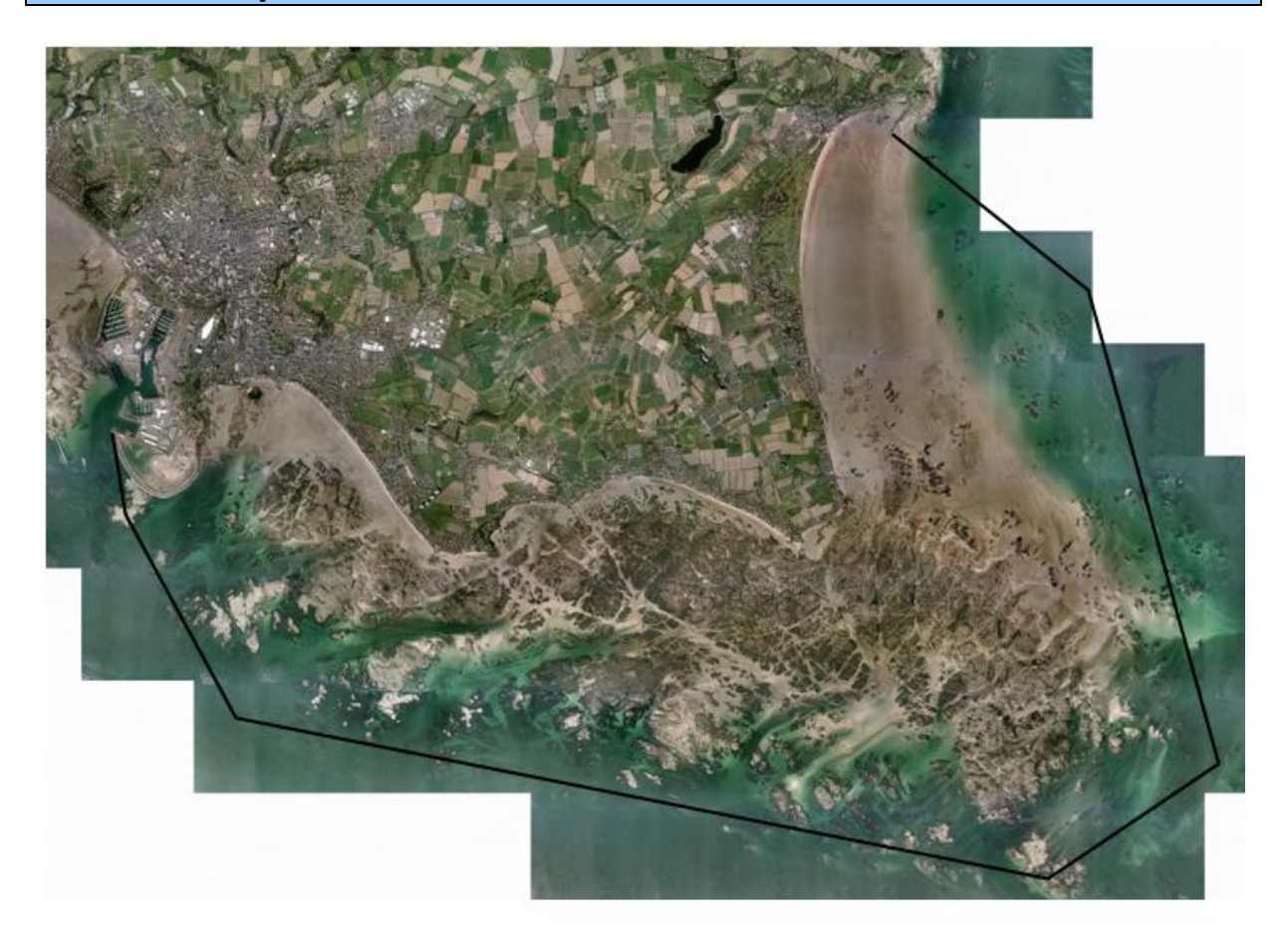
Figure 1. Extent of the South-East Coast Ramsar Site