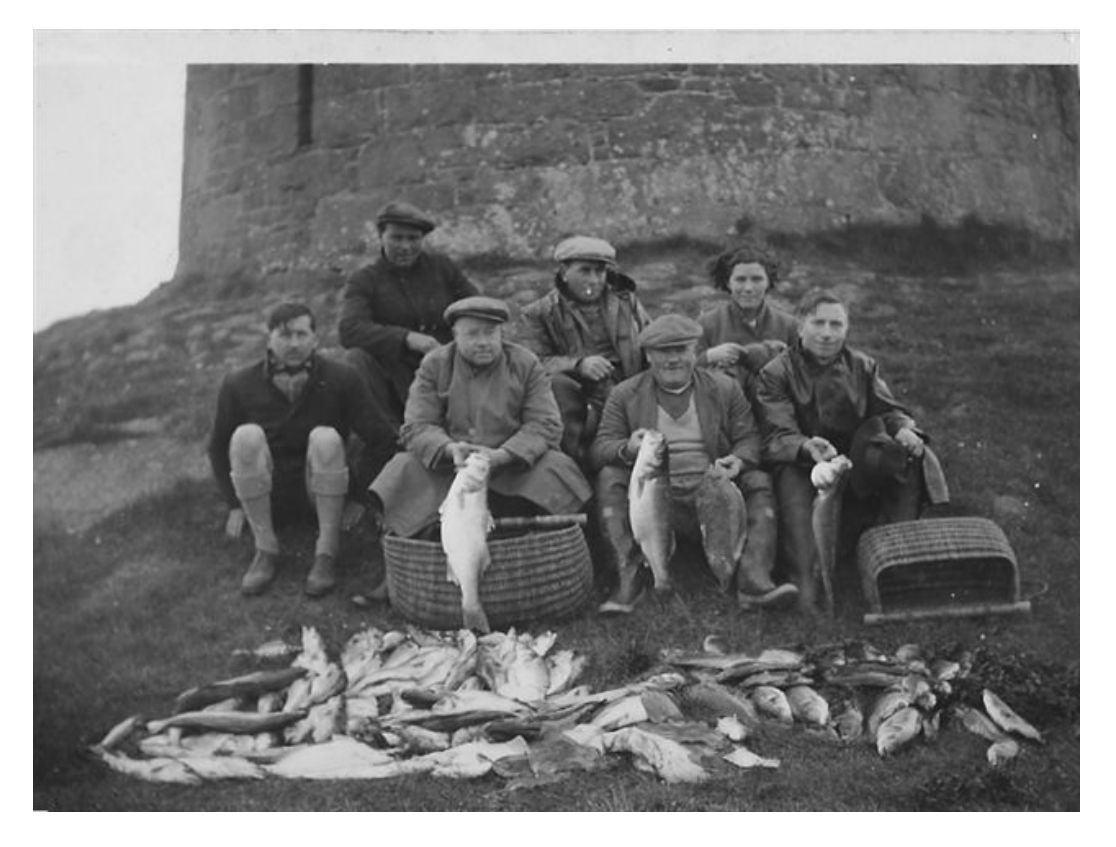
Catch from a day's fishing at Le Hocq circa 1934

There are several distinct facets that should be looked at when consideration is given to an assessment of economic value. There are clearly the extractive uses which have an economic value including commercial and recreational fishing and aquaculture. There are also other recreational pursuits that use the site but do not consume resources such as recreational and tourism activities such as boating, walking, wildlife watching, and the nature walks known locally as "moon walks". There are also a number of other activities that occur which are difficult to put a value on. Seaweed washed to the top of the beach is gathered by growers, both commercial and amateur, for application to arable land and gardens as a fertiliser and field dressing. Off-Island marketing of the famous Jersey Royal potato refers to the use of seaweed enhancing the flavour of very important crop. There is also the scenic value to residents who live adjacent to the site and it is of importance to those who simply value protecting a site and conserving natural resources for future generations. Whilst many of these values may be difficult to quantify there is an inherent value and therefore should be considered.