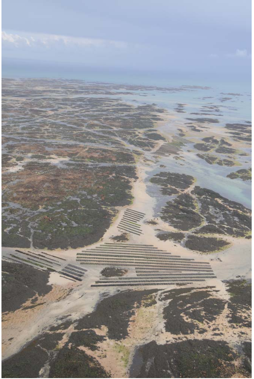
Matrix of Exposed Rock and Sandy Gullies -Part of the South east Coast Ramsar site

Limited jurisdiction remains an issue as many environmental impacts that affect or have the potential to effect arise from outside of the site and outside Jersey's territorial waters. An example of this would be some aspect of fisheries management, particularly management of pelagic fish stocks, where ultimate authority rests with the UK or EU.