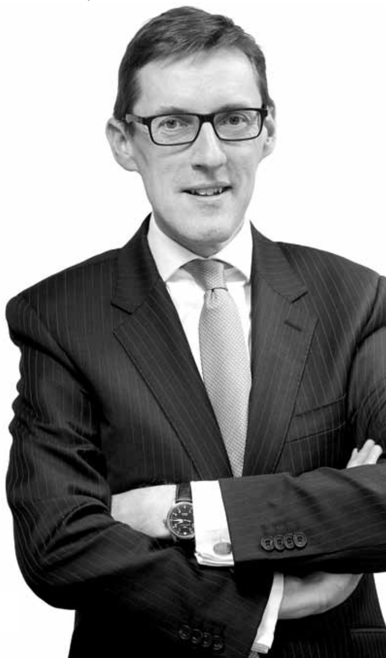
SENATOR IAN GORST CHIEF MINISTER OF JERSEY

"This document outlines the policies that are vital to the future of the financial services industry and sets out the government's framework to achieve future success, and thereby support local employment and the provision of public services to the benefit of all Island residents. Together with the regulator and industry, we will take the necessary action to ensure that the industry remains successful and competitive now and in the future."