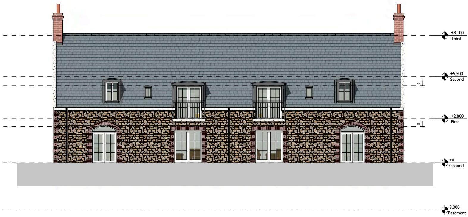
NORTH (REAR) ELEVATION 1:50