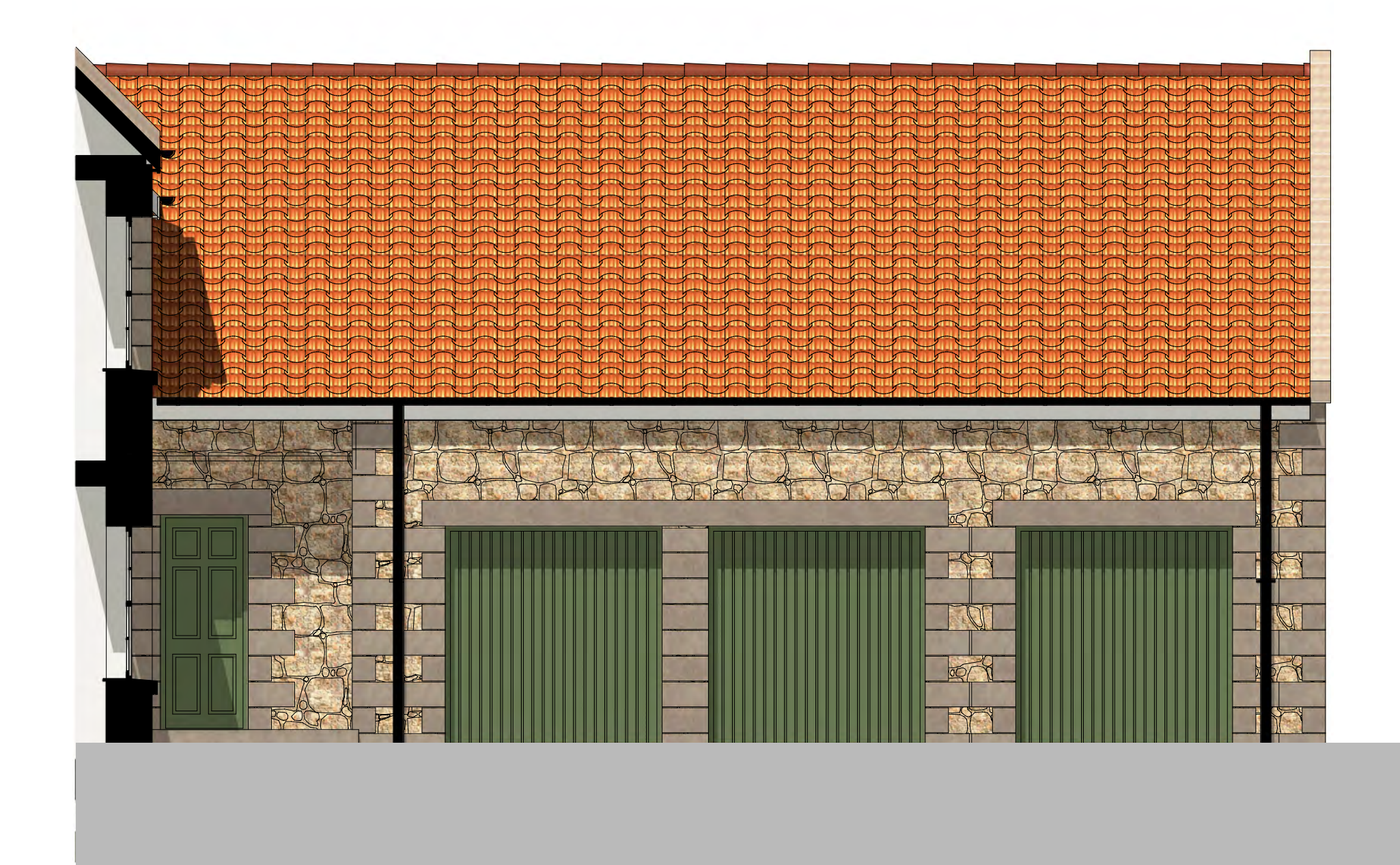
PART ELEVATION A