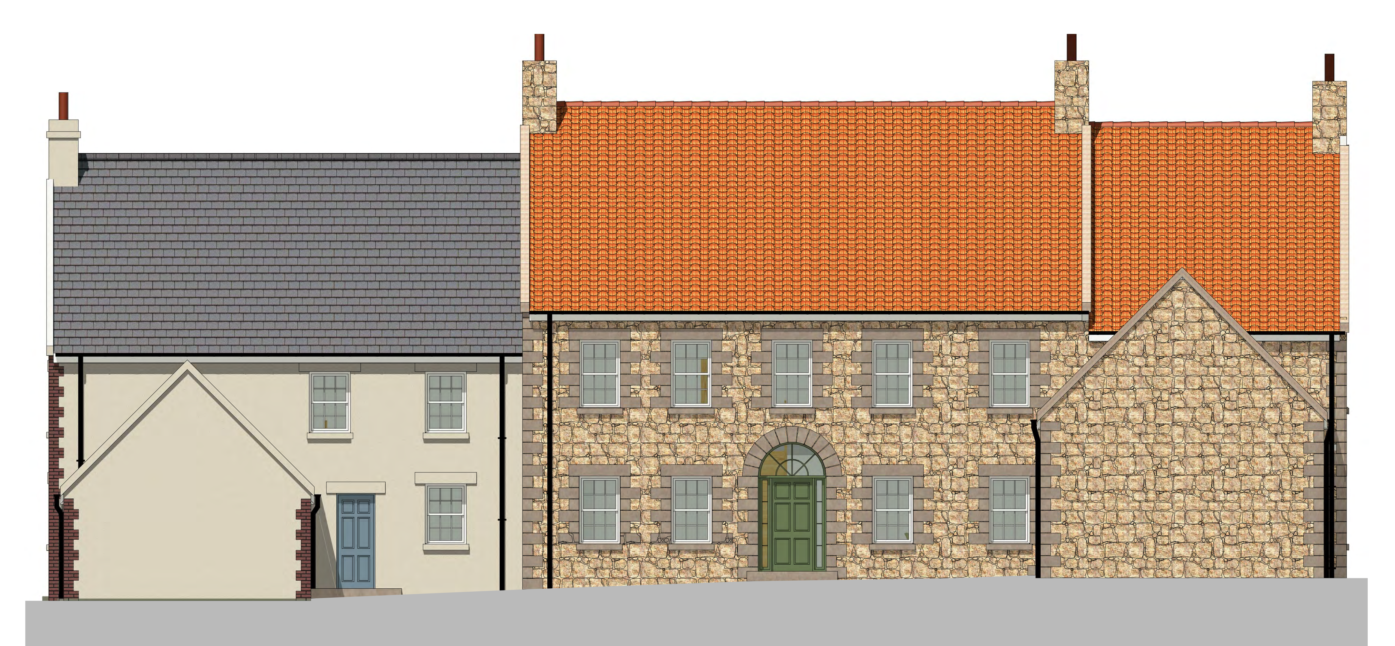
EAST (FRONT) ELEVATION