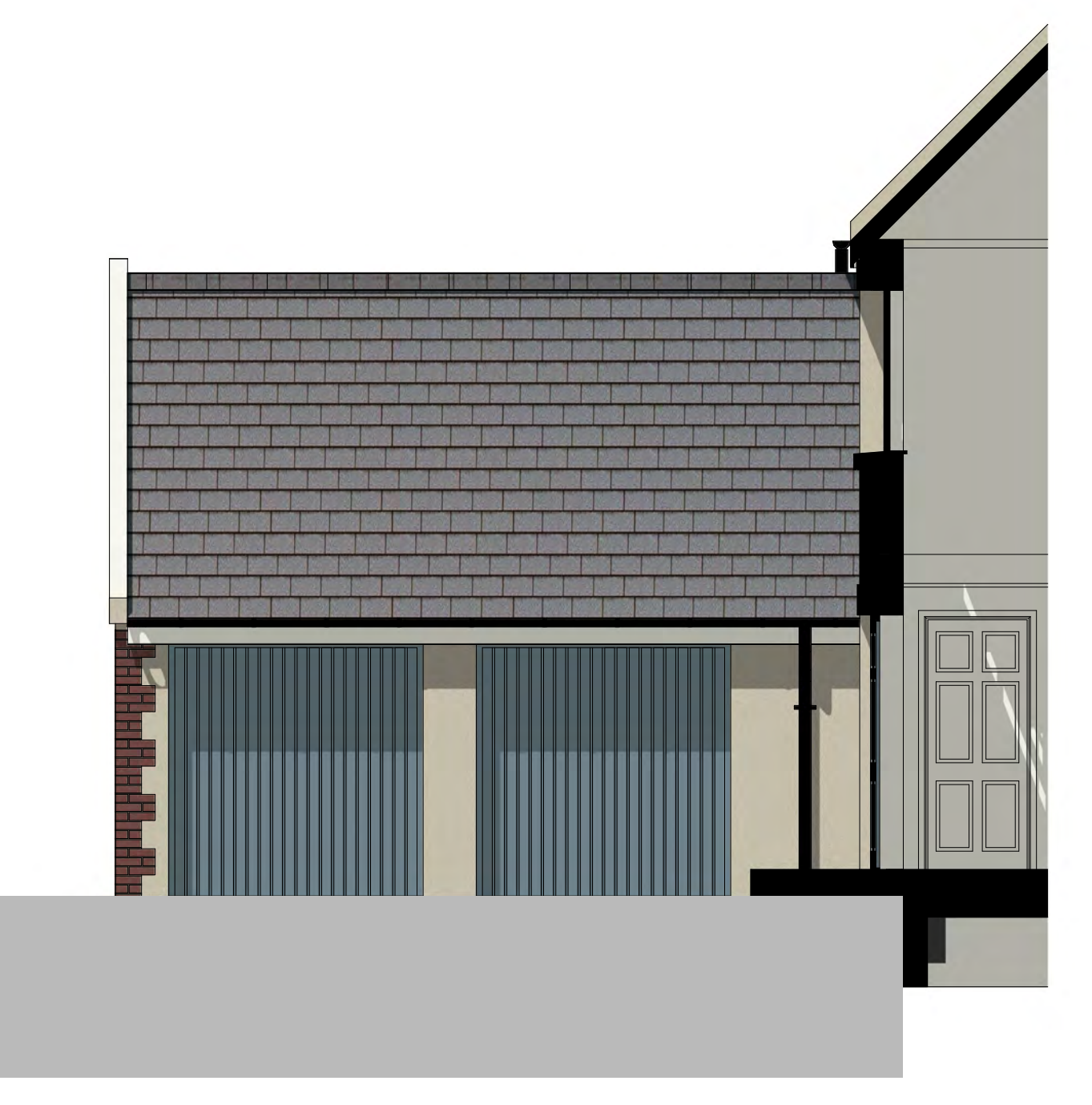
PART ELEVATION B