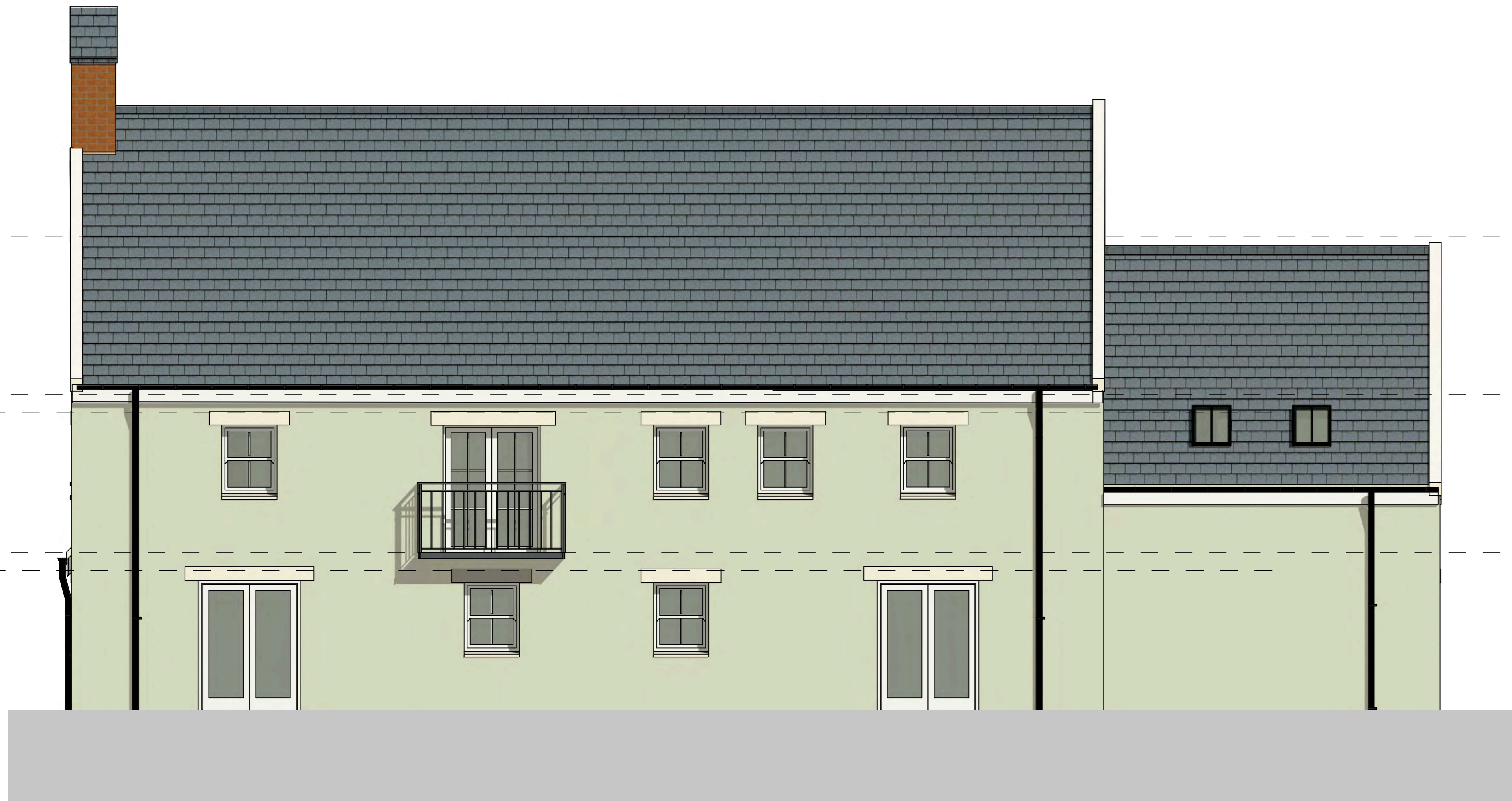
NORTH (REAR) ELEVATION