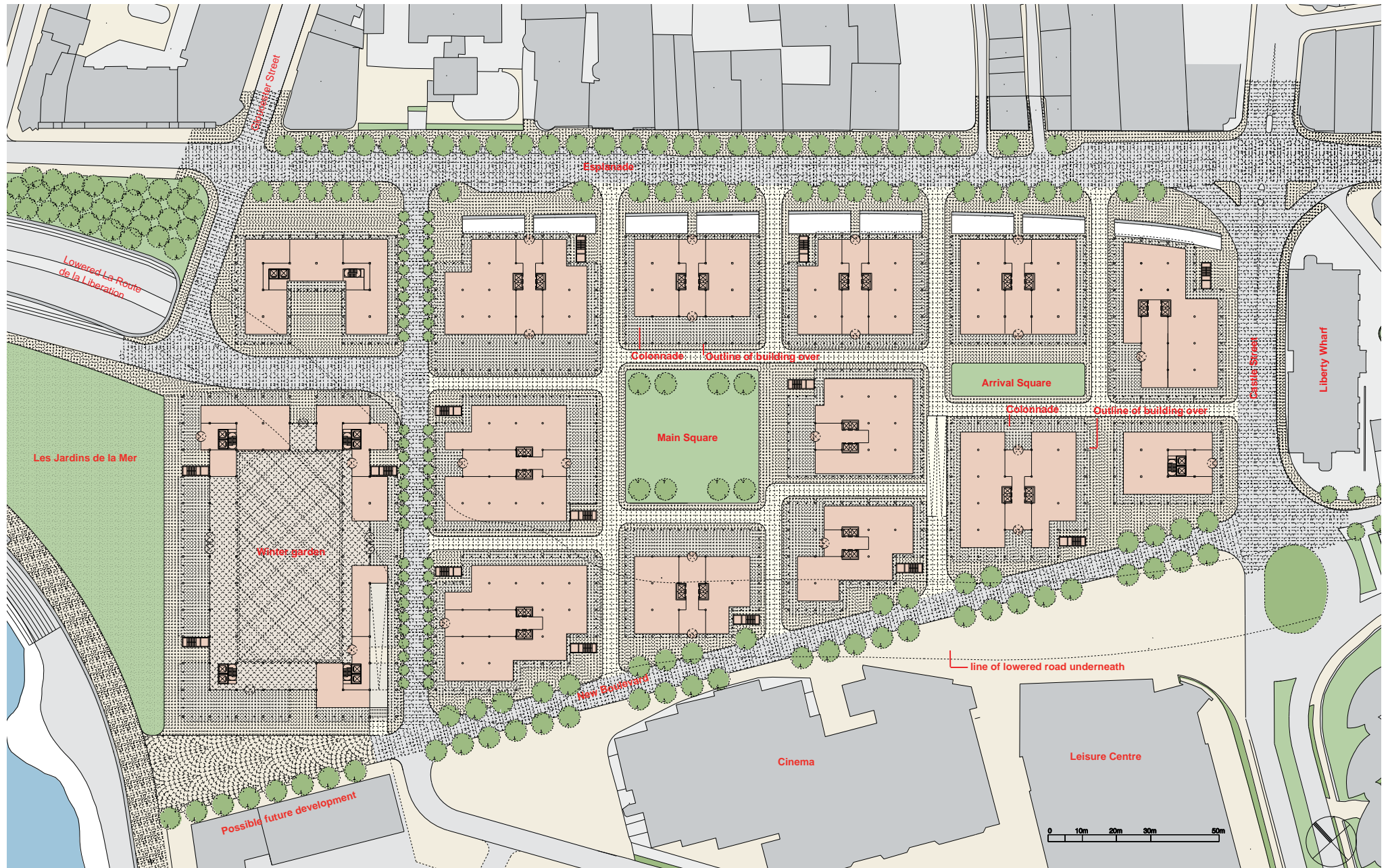
The Esplanade Quarter masterplan