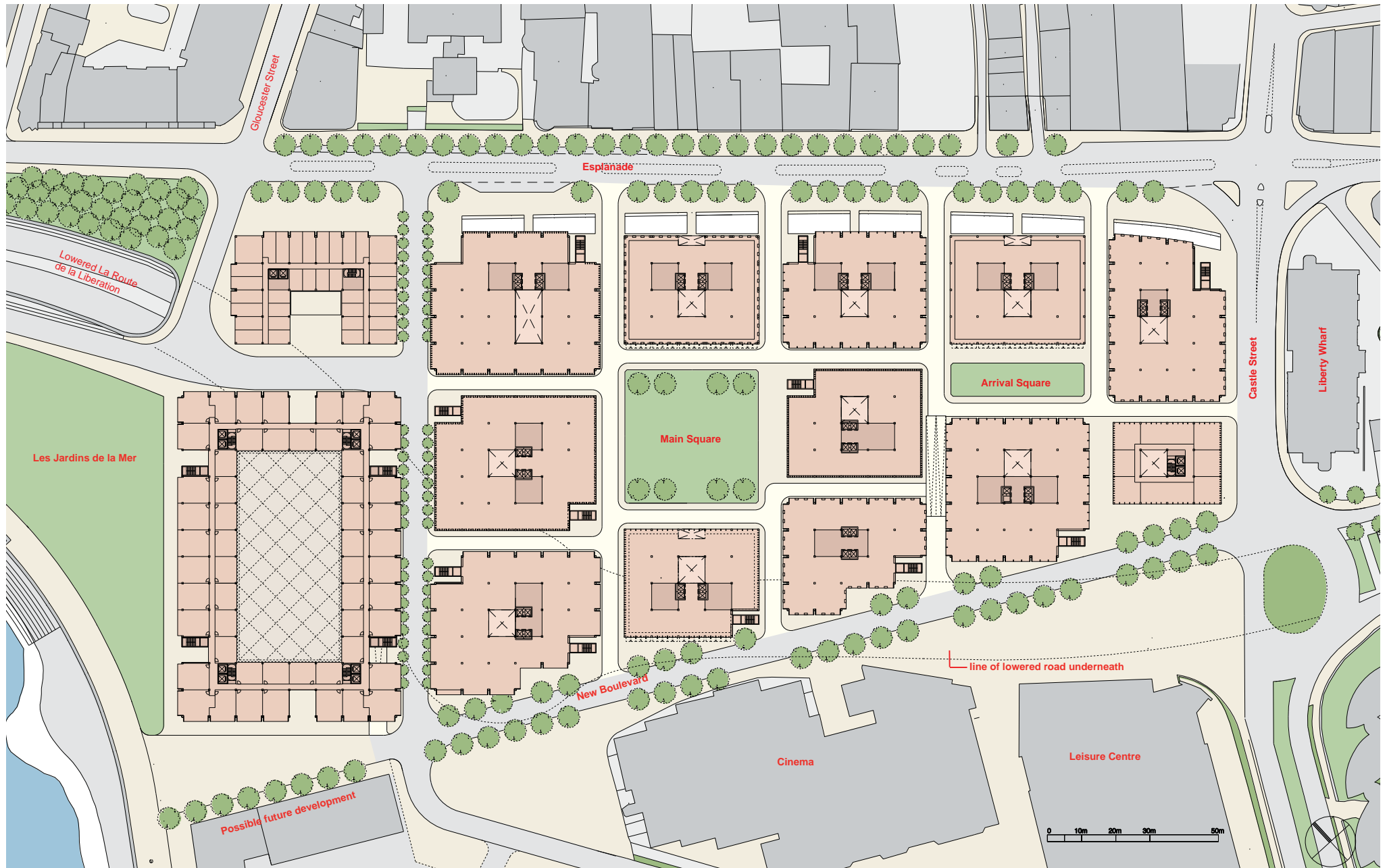
The Esplanade Quarter masterplan