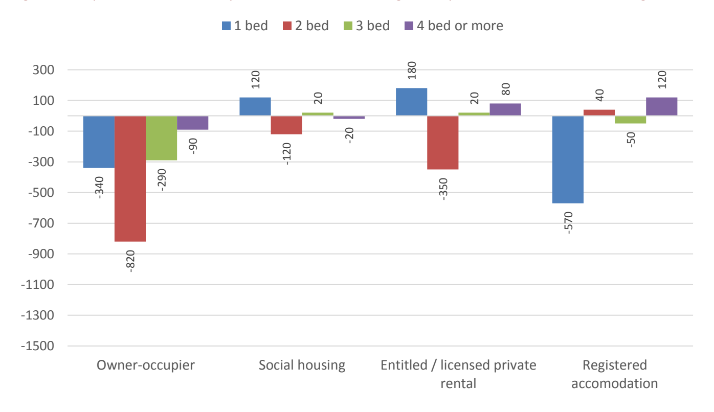
Figure 3 - Surpluses and shortfalls by tenure and size of dwelling; three-year totals under +1,500 net migration

Based on the above two scenarios, it can be seen that: