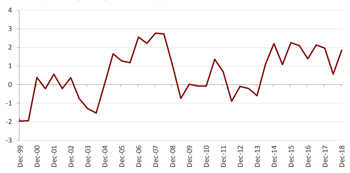
Figure 1 – Annual percentage change in workforce jobs: 1999–2018

Between 2005 and 2008, the total number of jobs grew at an annual rate of between 1% and 3%. Over the subsequent five-year period – 2009 to 2013 – the number of jobs was relatively flat, with periods of smaller growth and decline.