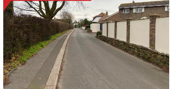
La Rue du Pontlietaut