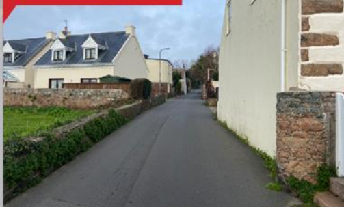
La Rue de Samarès