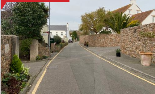
La Rue du Hocq