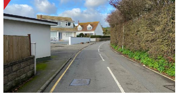
La Rue de Causie