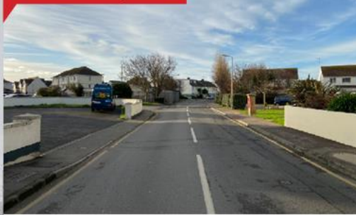
Rue du Maupertuis