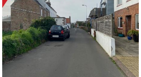
La Rue de la Croix