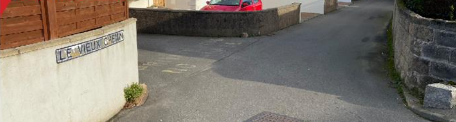
Le Vieux Chemin