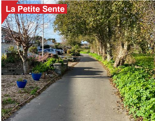
La Petite Sente