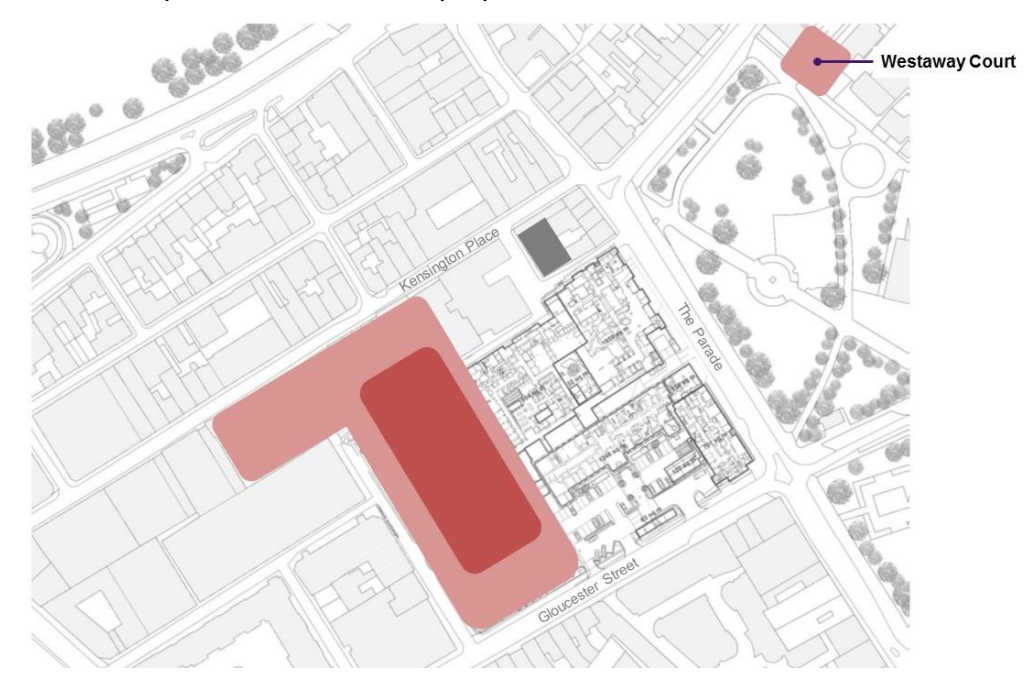
Figure 4.1 Previous scheme (2017) proposals footprint

4.6 The new proposal will be delivered in two phases (described in Chapter 3), over a greater site area of the existing JFH site and on Westaway Court. This allows for JFH to be built with a reduced height. Figures 4.1 and 4.2 illustrate the comparison between site area of the previous and current proposals.