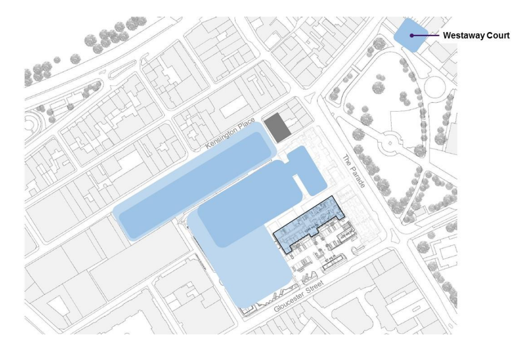
Figure 4.2 Current proposals footprint (2018)

Figure 4.1 Previous scheme (2017) proposals footprint