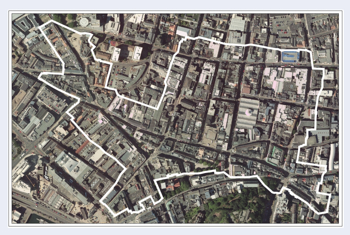
Map 5.2 Core Retail Area