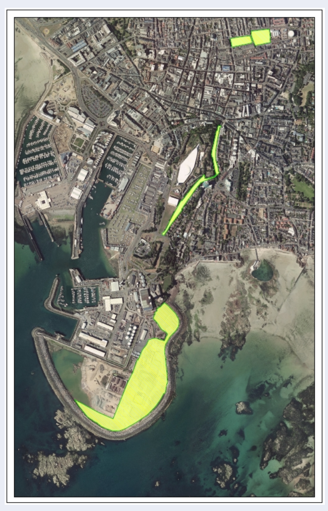
Map 7.2 Proposed New Urban Spaces