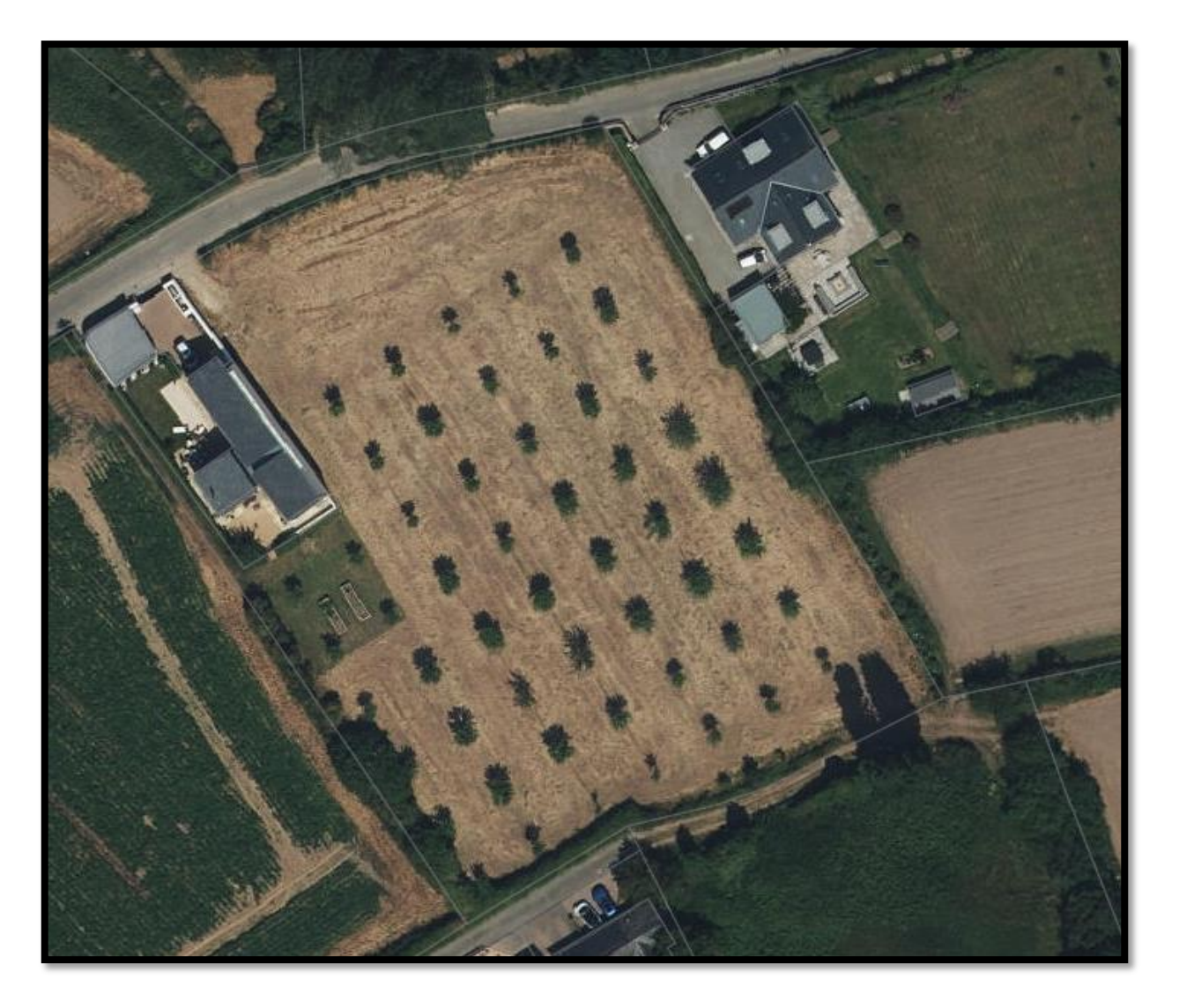
Aerial Image – 2021 Jersey Mapping System