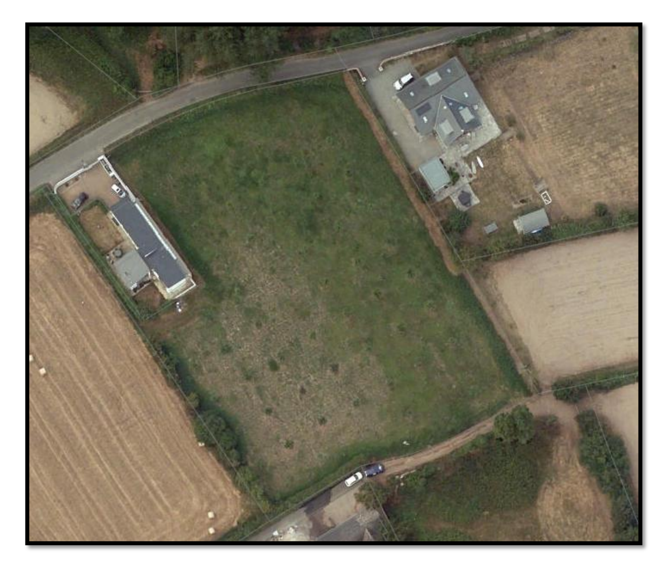
Aerial Image – 2019 Jersey Mapping System