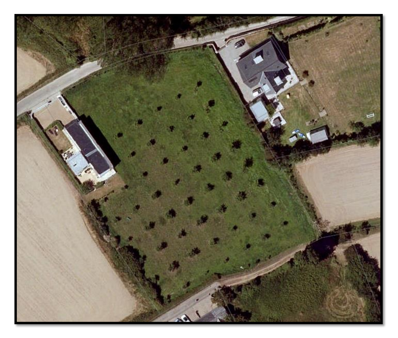
Aerial Image – 2020 Jersey Mapping System