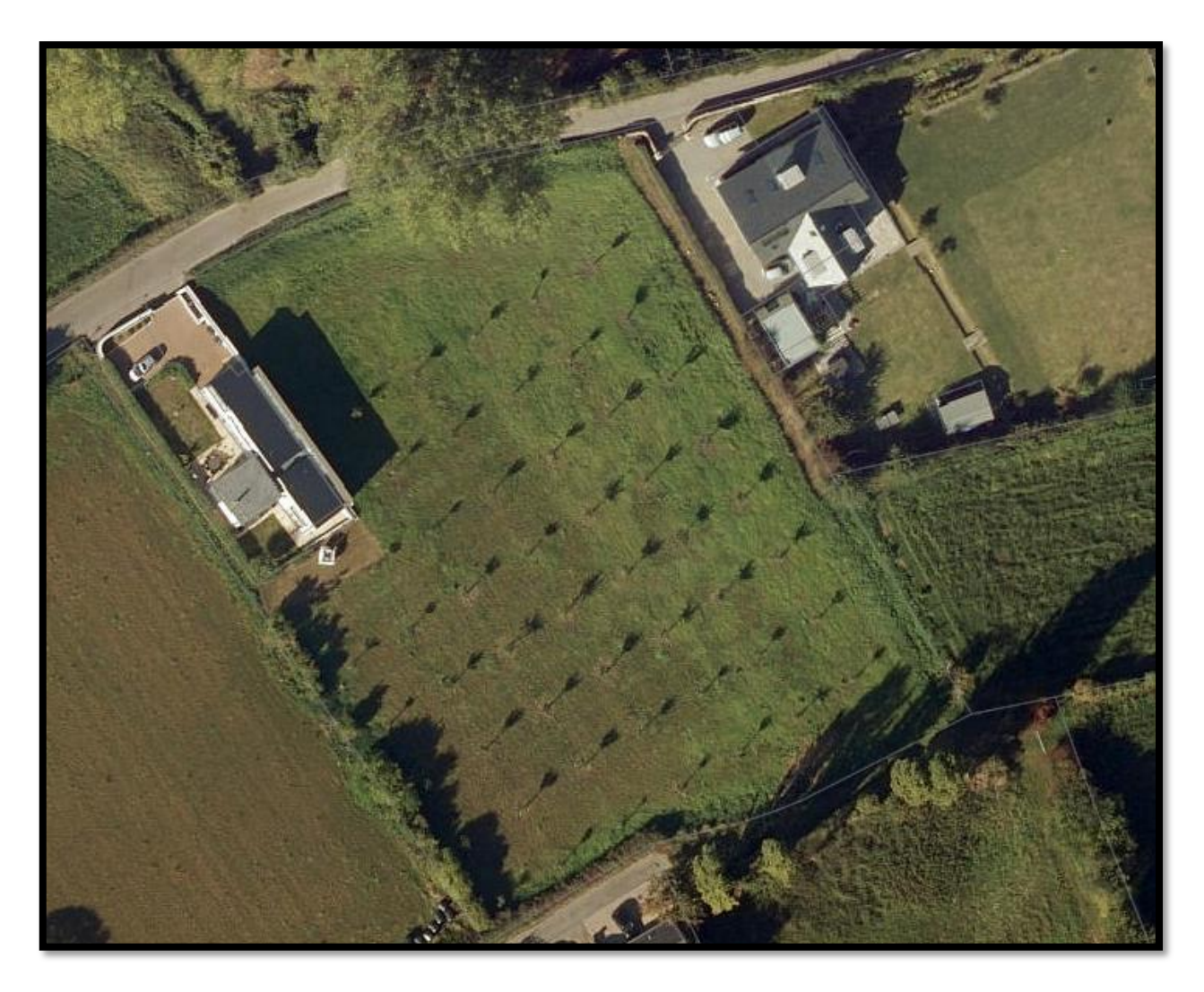
Aerial Image – 2018 Jersey Mapping System