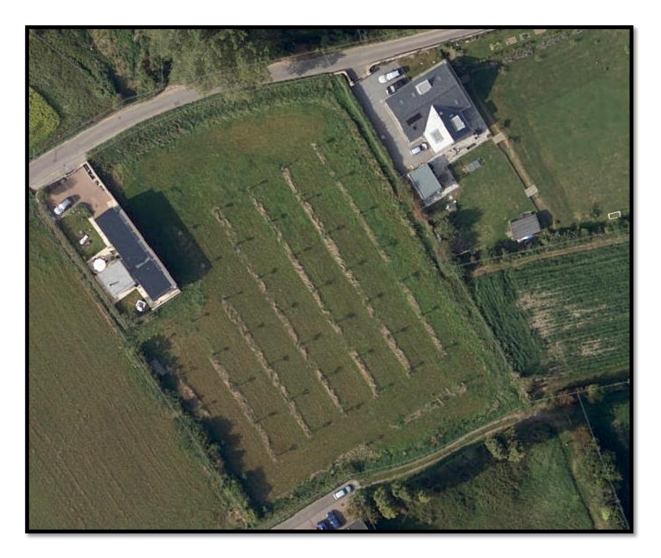
Aerial Image – 2017 Jersey Mapping System