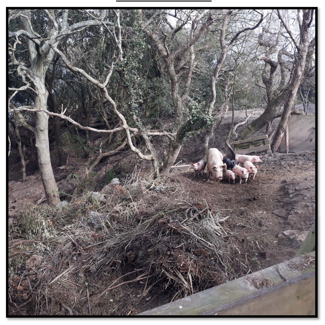
Woodland East of MN88