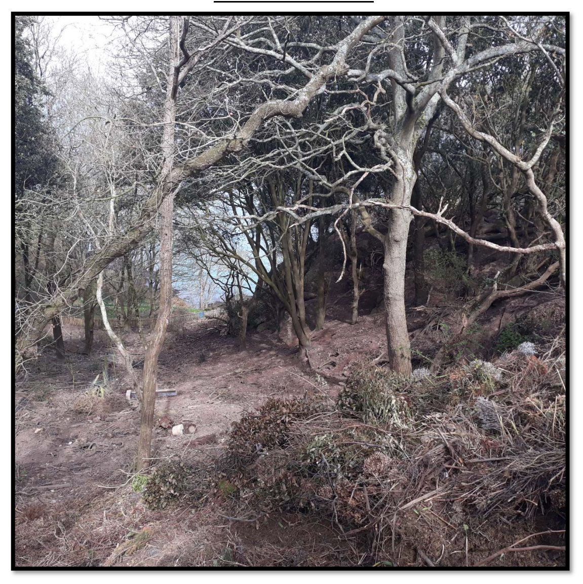
Woodland East of MN88