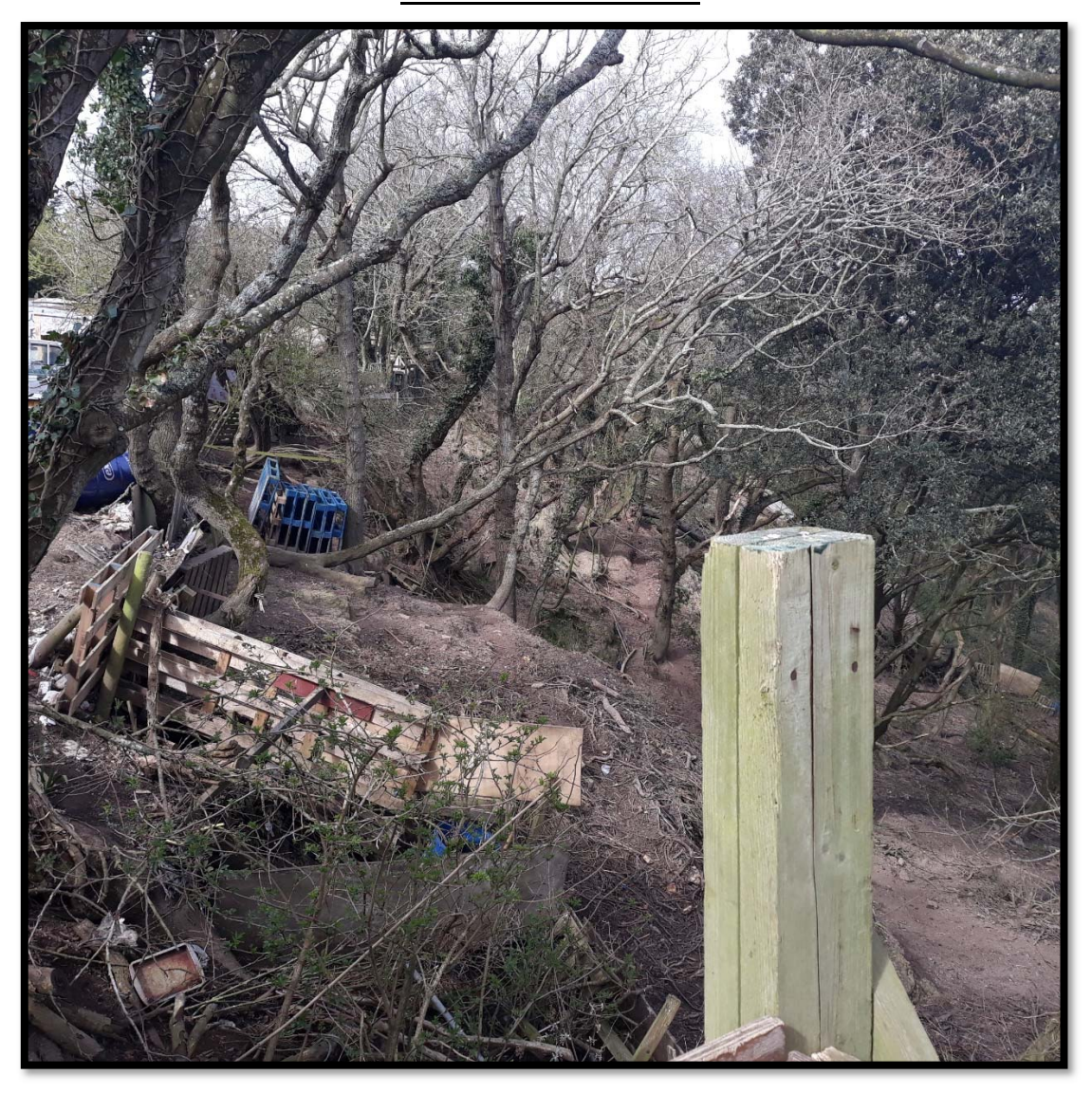
Woodland East of MN88