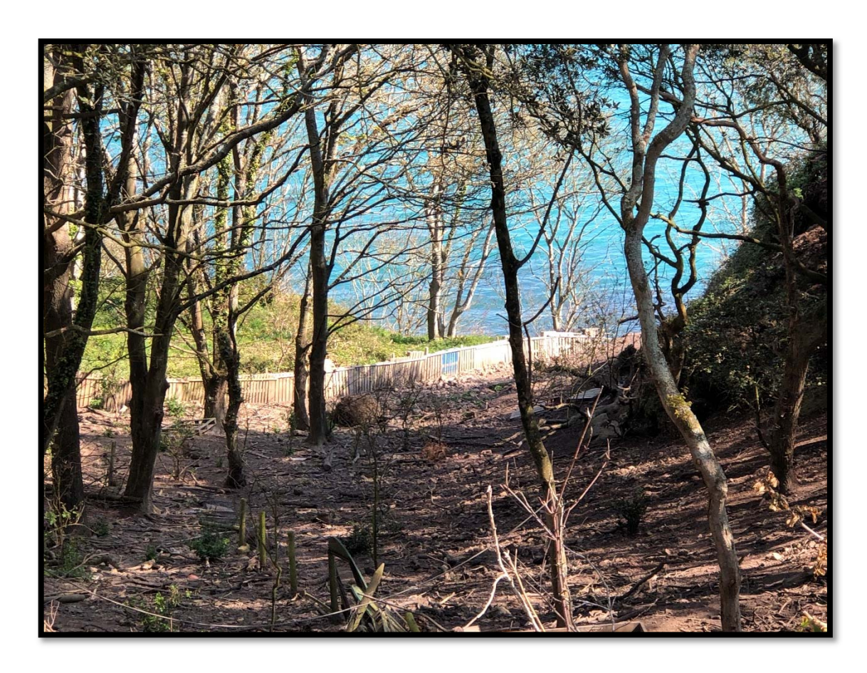
Woodland East of MN88