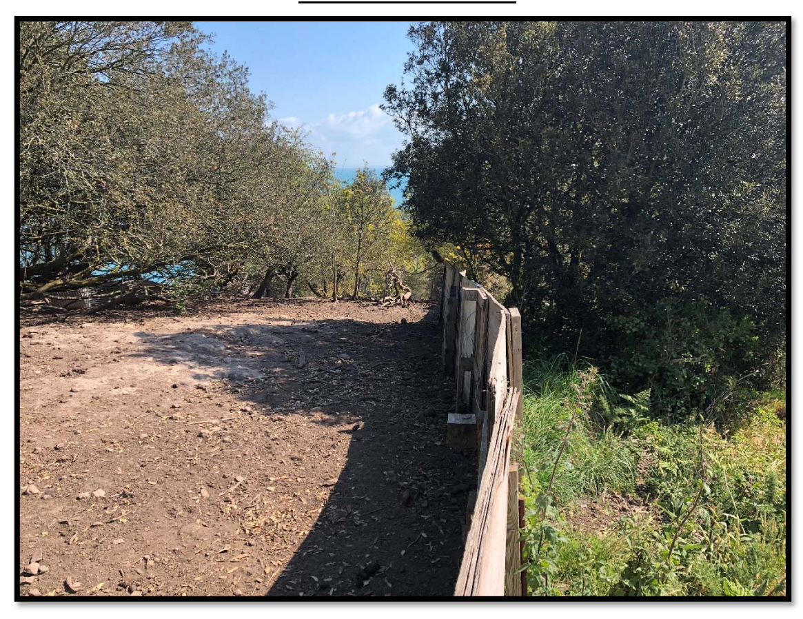
Woodland East of MN88