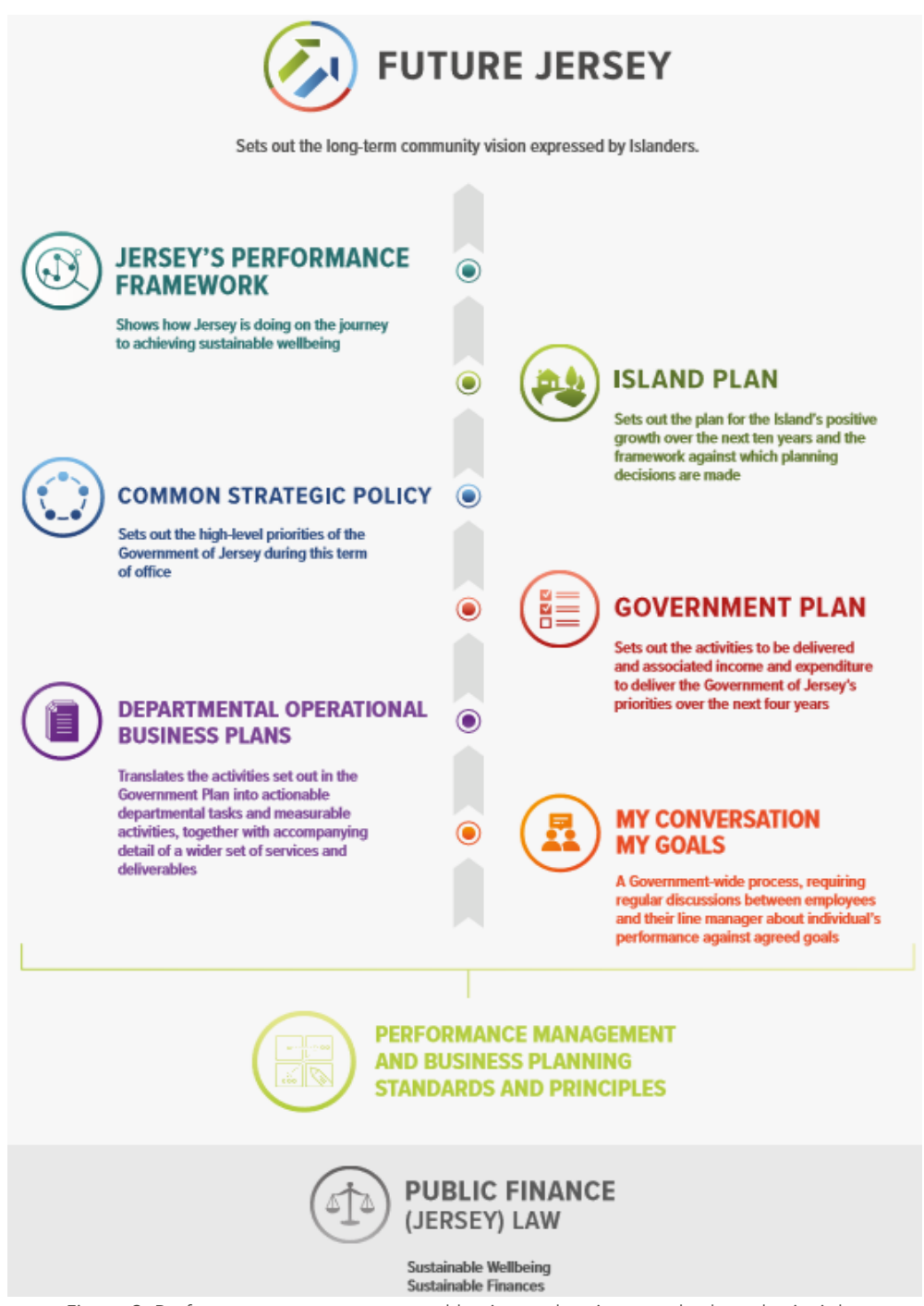
Figure 3: Performance management and business planning standards and principles