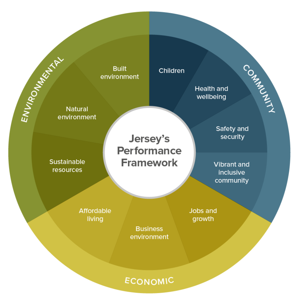
Figure 1 – Jersey Performance Framework

The bridging Island Plan is a unique response to a unique context. Initially, the Island Plan Review undertook to prepare a new long-term Island Plan. This review became delayed, in 2020, because resource was redirected to support the public health response to the Covid-19 pandemic and workstreams were disrupted and delayed. Rather than return to the preparation of a long-term Island Plan, which would delay publication of the plan to a later date, the bridging Island Plan provides the means to make important progress in key policy areas now. Bringing forward a shorter plan also recognises that, while there is always uncertainty in seeking to plan for the longer-term, that uncertainty is currently heightened by the potential impacts of the Coronavirus pandemic and changes associated with new post-Brexit arrangements.